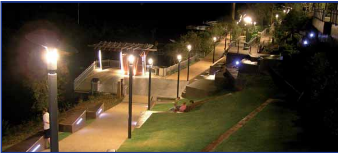
An excellent example of pedestrian scale lighting demonstrating how to decrease the perception of isolation and fear after dark.